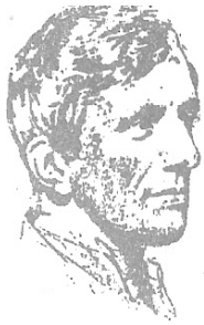
Venerable John Henry Cardinal Newman Cor ad cor loquitor